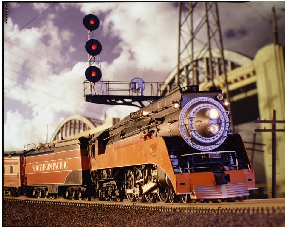
Southern Pacific GS-4 4-8-4 No. 4449 - ELECTRIC

ACCUCRAFT TRAINS 33268 Central Avenue Union City, CA 94544 Tel: 510 324-3399 Fax: 510 324-3366 email: info@accucraft.com